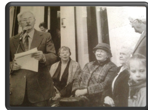
Someone with a Military voice was the Master of Ceremonies!!

The children of the village, led by Janet's Grandson piping, carried the old hall key across and exchanged it for the new one.